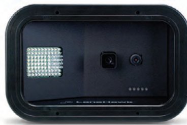
LaneHawk Intelligent Lighting and Camera Unit

One of the key features of LaneHawk is its Enterprise Manager. The Enterprise Manager keeps track of LaneHawk lane status, software updates, modelsets, and most importantly, generates reports to detail cashier performance.